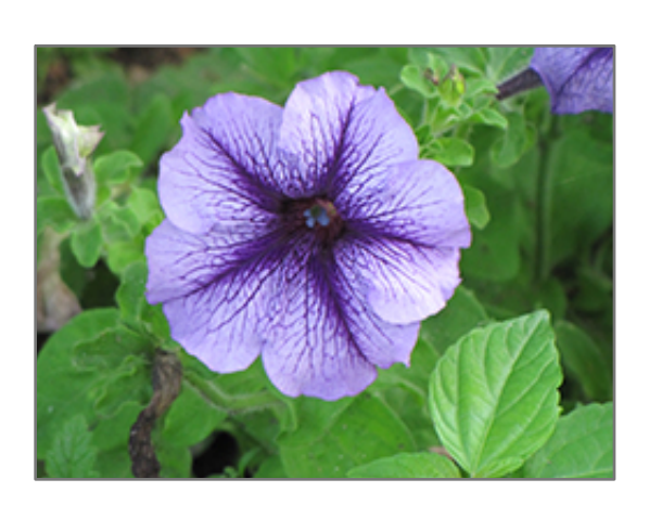
Hurrah Blue Veined Petunia flowers

Hurrah Blue Veined Petunia is draped in stunning blue trumpet-shaped flowers with navy blue veins at the ends of the stems from mid spring to late summer. Its pointy leaves remain green in colour throughout the season.