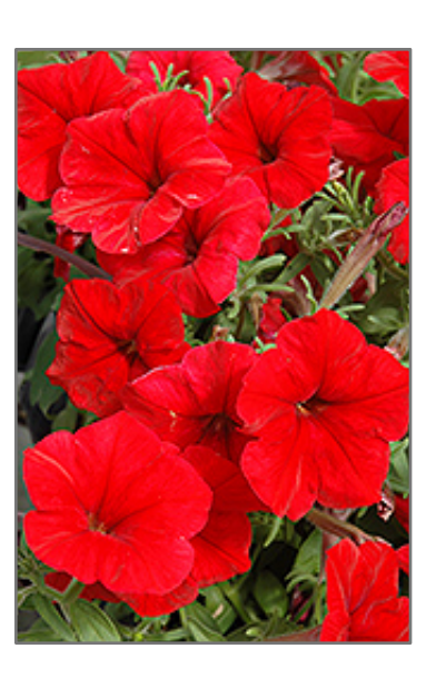
Madness Red Petunia flowers

Madness Red Petunia is bathed in stunning red trumpet-shaped flowers at the ends of the stems from mid spring to late summer. Its pointy leaves remain green in colour throughout the season.