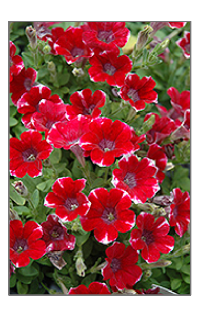
Littletunia Red Star Petunia flowers

Littletunia Red Star Petunia is covered in stunning red trumpet-shaped flowers with white edges at the ends of the stems from mid spring to late summer. Its pointy leaves remain green in colour throughout the season.