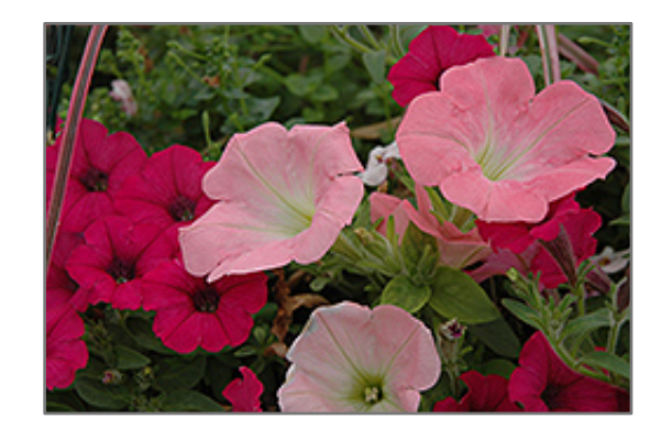
Potunia Pink Petunia flowers

Hardiness Zone: (annual) Group/Class: Potunia Series