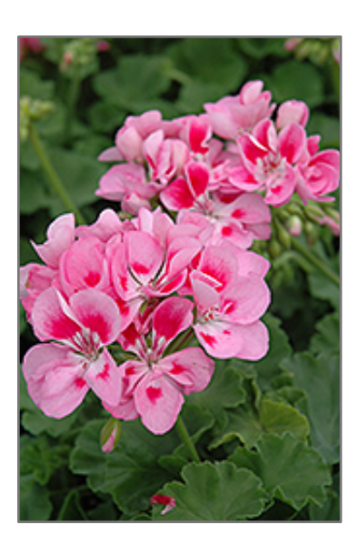
Allure Light Pink Geranium flowers

Allure Light Pink Geranium features bold balls of lightly-scented shell pink flowers with white eyes and cherry red streaks at the ends of the stems from late spring to early fall. The flowers are excellent for cutting. Its tomentose round palmate leaves remain green in colour with prominent brown stripes throughout the year.