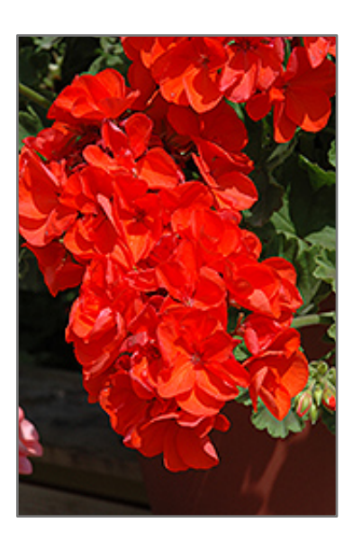
Allure Tangerine Geranium flowers

Allure Tangerine Geranium features bold balls of lightly-scented orange flowers at the ends of the stems from late spring to early fall. The flowers are excellent for cutting. Its tomentose round palmate leaves remain green in colour with prominent brown stripes throughout the year.