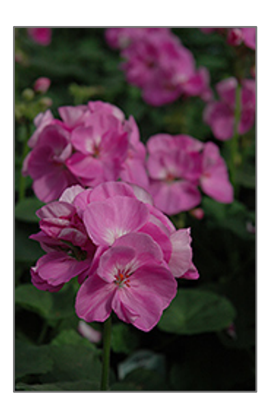
Blue Wonder Geranium flowers

Blue Wonder Geranium features bold balls of lightly-scented purple flowers with pink overtones at the ends of the stems from late spring to early fall. The flowers are excellent for cutting. Its tomentose round palmate leaves remain green in colour with prominent brown stripes throughout the year.