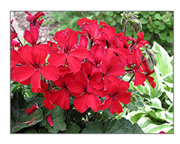
Caliente Fire Geranium flowers

This plant will require occasional maintenance and upkeep. Trim off the flower heads after they fade and die to encourage more blooms late into the season. It has no significant negative characteristics.