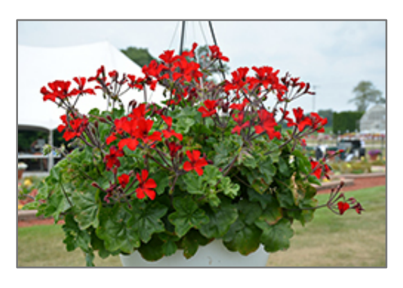
Caliente Fire Geranium in bloom

Caliente Fire Geranium is recommended for the following landscape applications;