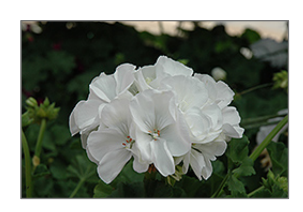
Classic White Geranium flowers

A classic selection for annual containers, baskets, and beds; well branched plants with medium vigor; bright white flower clusters provide all season color