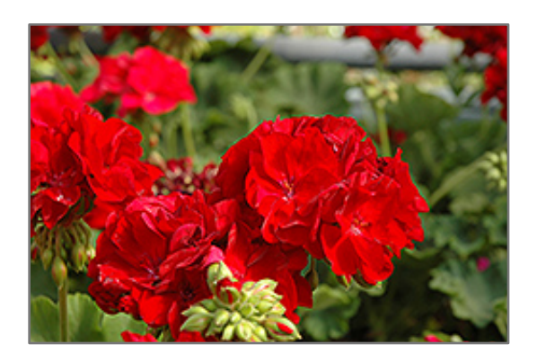
Cumbanita Dark Red Geranium flowers