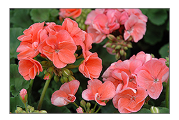
Designer Salmon Geranium flowers

Hardiness Zone: (annual) Group/Class: Designer Series