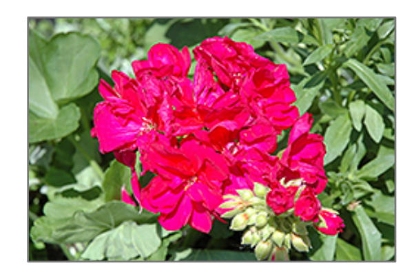
Designer Violet Geranium flowers

Hardiness Zone: (annual) Group/Class: Designer Series