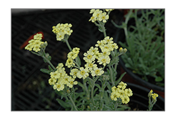
King Edward Yarrow flowers

A low growing, drought tolerant, dwarf selection that features silvery, grey-green foliage and buttery yellow flowers; deadhead to encourage new growth; a wonderful addition to borders, mass planting and fresh cut flower arrangements