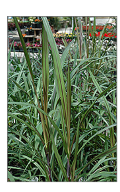
Princess Fountain Grass foliage

Princess Fountain Grass is primarily valued in the garden for its cascading habit of growth. It attractive grassy leaves are burgundy in colour. As an added bonus, the foliage turns a gorgeous brick red in the fall.