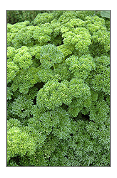
Parsley foliage

Parsley will grow to be about 12 inches tall at maturity, with a spread of 24 inches. When grown in masses or used as a bedding plant, individual plants should be spaced approximately 18 inches apart. Although it's not a true annual, this fast-growing plant can be expected to behave as an annual in our climate if left outdoors over the winter, usually needing replacement the following year. As such, gardeners should take into consideration that it will perform differently than it would in its native habitat.