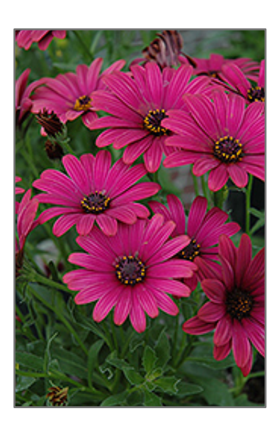
Summertime Red Velvet African Daisy flowers

Summertime Red Velvet African Daisy is smothered in stunning rose daisy flowers with purple overtones at the ends of the stems from early summer to mid fall. The flowers are excellent for cutting. Its spiny narrow leaves remain green in colour throughout the season.