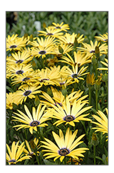
Lemon Symphony African Daisy flowers

Lemon Symphony African Daisy is bathed in stunning yellow daisy flowers with purple centers at the ends of the stems from early summer to mid fall. The flowers are excellent for cutting. Its spiny narrow leaves remain green in colour throughout the season.