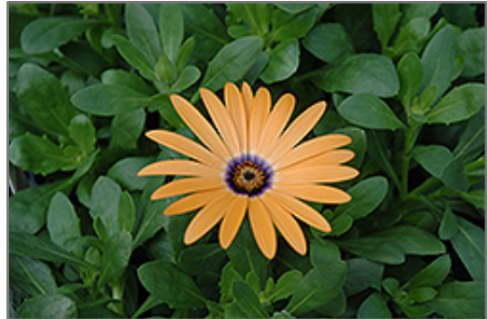
Orange Symphony African Daisy flowers