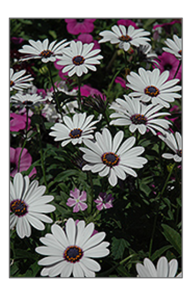
Soprano White African Daisy flowers

Soprano White African Daisy is bathed in stunning white daisy flowers with purple centers at the ends of the stems from early summer to mid fall. The flowers are excellent for cutting. Its spiny narrow leaves remain green in colour throughout the season.