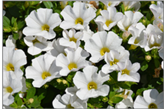
Cabaret White Calibrachoa flowers

This plant will require occasional maintenance and upkeep. Trim off the flower heads after they fade and die to encourage more blooms late into the season. It is a good choice for attracting bees and hummingbirds to your yard, but is not particularly attractive to deer who tend to leave it alone in favor of tastier treats. It has no significant negative characteristics.