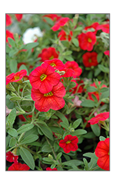
Callie Scarlet Red Calibrachoa flowers

A beautiful long blooming, trailing variety perfect for hanging baskets, patio containers, borders and garden landscapes; vibrant trumpeted blooms cascade, creating a gorgeous display of color; deadhead to prolong bloom time