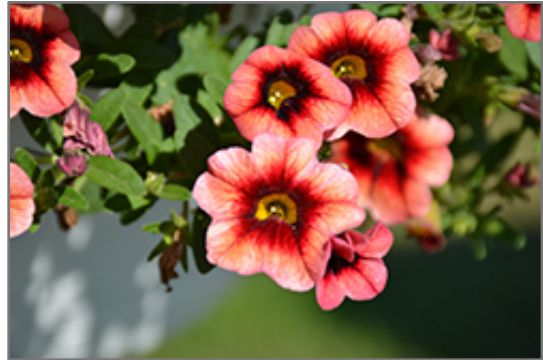
Superbells Coralberry Punch Calibrachoa flowers

Superbells Coralberry Punch Calibrachoa is a dense herbaceous annual with a trailing habit of growth, eventually spilling over the edges of hanging baskets and containers. Its medium texture blends into the garden, but can always be balanced by a couple of finer or coarser plants for an effective composition.