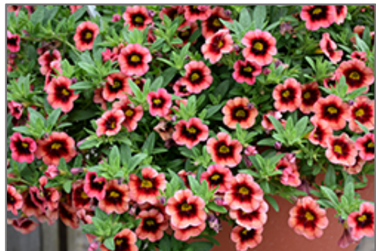
Superbells Coralberry Punch Calibrachoa flowers