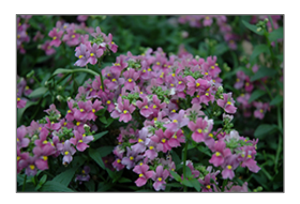
Aromatica Rose Pink Nemesia flowers