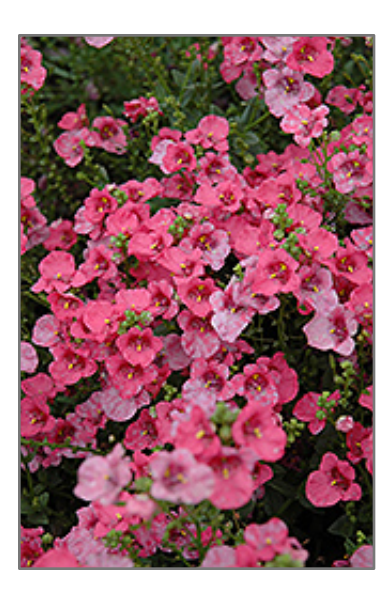
Darla Rose Twinspur flowers

A cool weather series that features bright pops of rosy-pink pea like flowers contrasting against green point foliage; uniform and tidy mounded habit, perfect for cool season containers and baskets