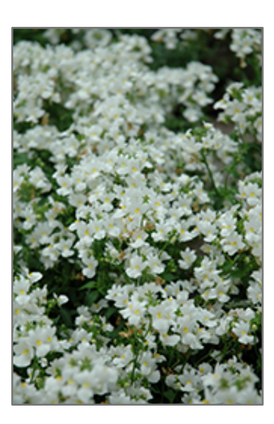
Aromatica White Nemesia flowers

Aromatica White Nemesia features dainty spikes of fragrant white pea-like flowers at the ends of the stems from late spring to late summer. Its small pointy leaves remain green in colour throughout the season.