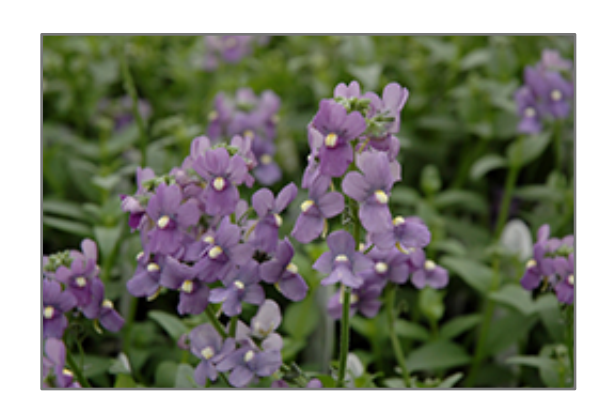
Bluebird Nemesia flowers