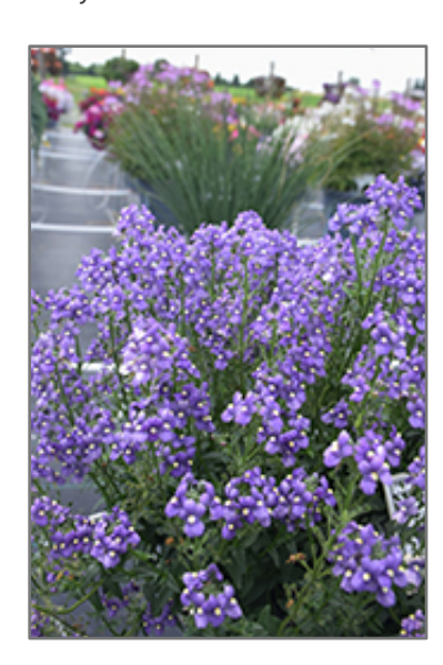
Bluebird Nemesia flowers