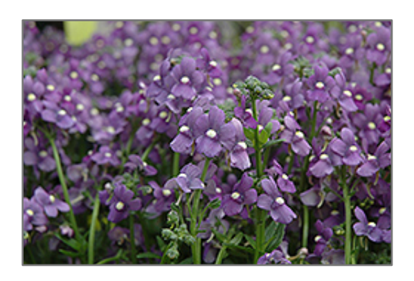
Enchanting Blue Nemesia flowers