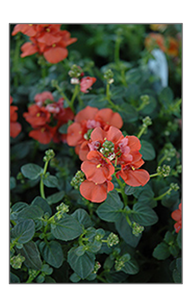
Flirtation Orange Diascia flowers

A colorful cool weather series featuring a sturdy, semi-trailing habit, perfect for hanging baskets, window boxes or garden landscapes; a profuse bloomer, producing brightly colored flowers over green, pointy foliage; excellent for early spring planting