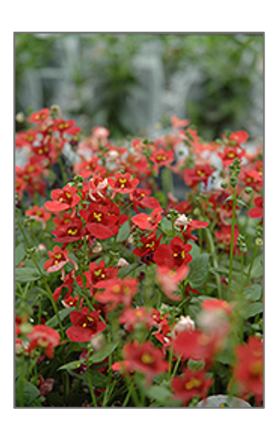
Romeo Red Twinspur flowers

A wonderful upright mounded series that features masses of large, colorful, pea-like flowers rising above green foliage; prefers cooler weather; perfect for hanging baskets, containers, garden beds or borders