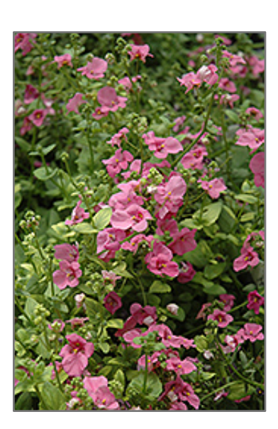
Trailing Antique Rose Twinspur flowers

An early to bloom and long lasting series that features a wonderful trailing habit, ideal for hanging baskets and patio containers; vibrant, colorful flowers bloom from late spring through to the fall; easy to grow with a good heat tolerance