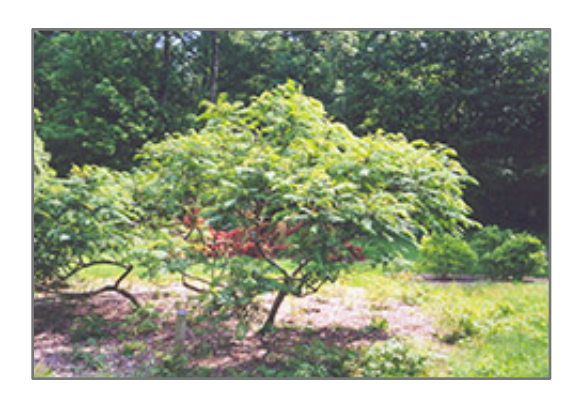
Cutleaf Smooth Sumac

An exotic yet hardy shrub with stout, pithy stems and fronds of finely cut tropical-looking leaves, good texture effect, somewhat leggy; interesting upright spikes of red-purple fruit and brilliant fall colors; suckers vigorously, ideal for naturalizing