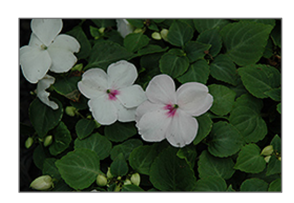
Dazzler Bright Eye Impatiens flowers

A landscape friendly series producing healthy, uniform plants; puts on a big show of stunning bright and colorful blooms from late spring through summer; excellent for gardens, border edges or containers