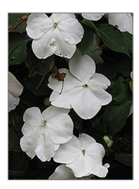
DeZire White Impatiens flowers

A lovely well rounded variety with excellent uniformity, from habit to flowering; large, brightly colored flowers nestle atop well-branched, compact plants with attractive green foliage; a charming choice for hanging baskets, containers or landscapes