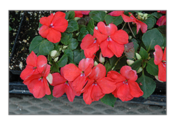
Envoy Salmon Impatiens flowers

A well mounded and easy to grow selection providing pops of color to garden beds, borders and containers; large, round salmon-pink flowers sit nestled atop attractive green foliage; shade tolerance and low maintenance