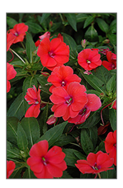
Fanfare Bright Coral Impatiens flowers

A lovely, mounded variety with trailing tendencies, perfect for hanging baskets and combination planters; tolerating some heat and boasting prolific flowering throughout the season; bright, vibrant blooms nestle atop attractive green foliage