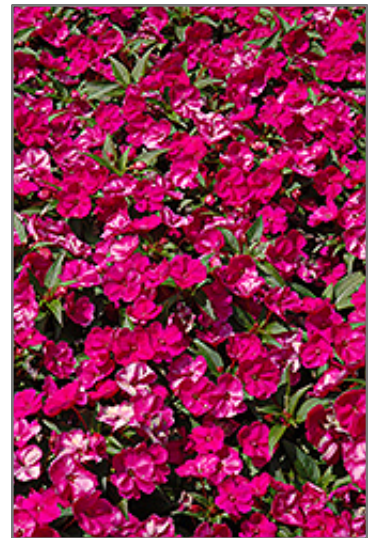
Fanfare Fuchsia Impatiens flowers