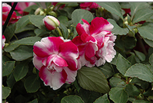
Fiesta Ole Purple Stripe Double Impatiens flowers