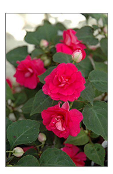
Fiesta Ole Purple Double Impatiens flowers

Shade tolerant with excellent branching and uniformity, this series presents large, brightly colored, double blooms resembling roses; self-cleaning, no deadheading needed; an outstanding choice for garden landscapes and containers