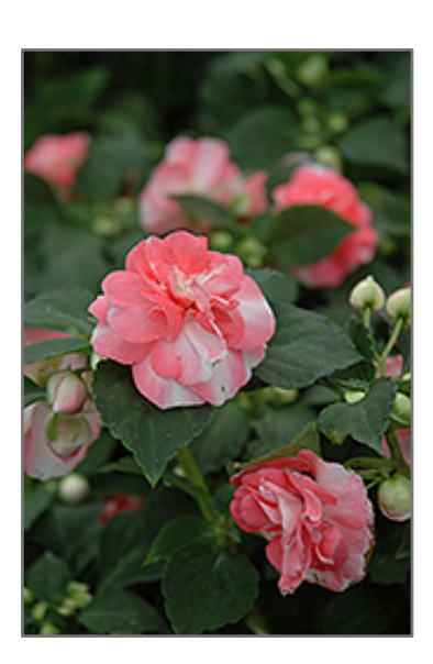
Fiesta Sparkler Salmon Double Impatiens flowers

Shade tolerant with excellent branching and uniformity, this series presents large, brightly colored, double blooms resembling roses; self-cleaning, no deadheading needed; an outstanding choice for garden landscapes and containers