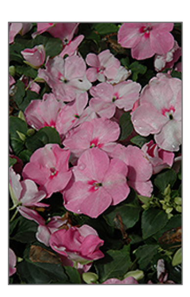
Show Off Pink Impatiens flowers

A beautifully mounded variety presenting large, vibrant blooms over attractive green foliage; shade tolerant and easy to grow, perfect for adding color and texture to garden beds, borders and containers; low maintenance