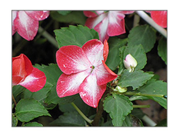
Stardust Rose Impatiens flowers