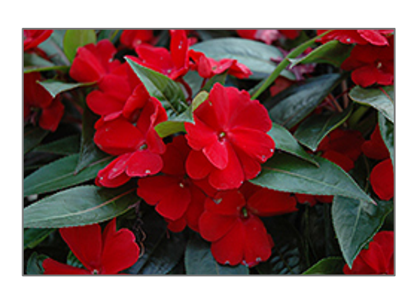
Celebration Deep Red New Guinea Impatiens flowers

A vigorous and well branched mounded variety with excellent shade and heat tolerance; large, vibrant blooms attract butterflies and hummingbirds; no pruning or deadheading required; excellent choice for beds, borders or large containers