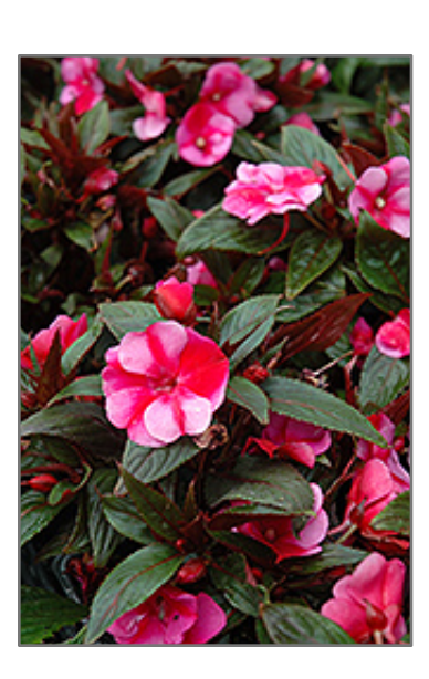
Celebrette Orchid Star New Guinea Impatiens flowers

A lovely self-cleaning variety needing little to no maintenance, perfect for garden beds, borders and containers; well branched, mounded habit with excellent shade tolerance; large, vibrant flowers nestle atop deep green foliage on compact plants