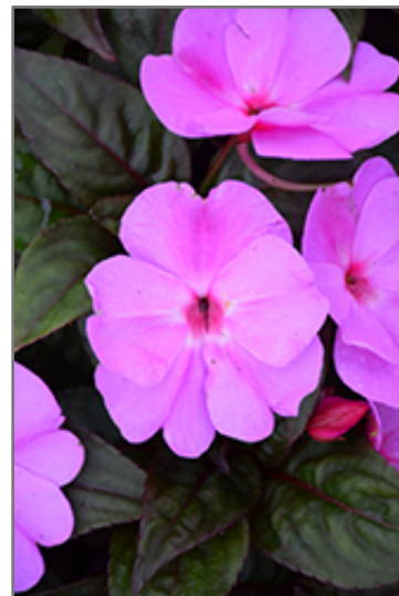
Divine Lavender New Guinea Impatiens flowers

Divine Lavender New Guinea Impatiens is recommended for the following landscape applications;