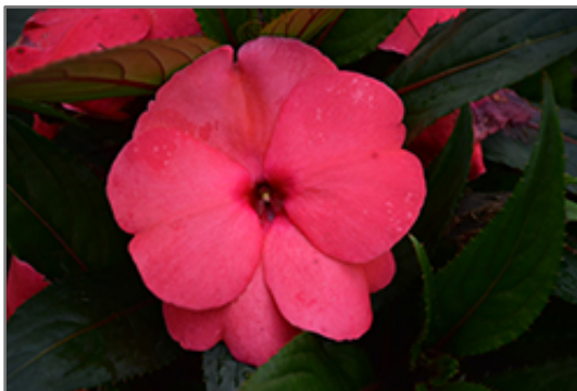
Magnum Hot Pink New Guinea Impatiens flowers

Magnum Hot Pink New Guinea Impatiens is recommended for the following landscape applications;