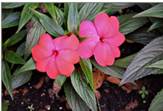
Magnum Hot Pink New Guinea Impatiens flowers