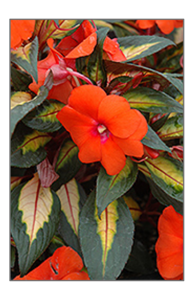
Painted Paradise Orange New Guinea Impatiens flowers

A lovely, vigorous mounded variety featuring large, vibrant blooms over interesting variegated foliage; a perfect way to add color to shaded garden beds, borders or containers; low maintenance and easy to grow