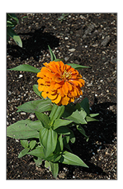
Magellan Sunburst Zinnia flowers

Magellan Sunburst Zinnia features bold harvest gold ball-shaped flowers with yellow eyes at the ends of the stems from mid spring to late summer. The flowers are excellent for cutting. Its pointy leaves remain green in colour throughout the season.