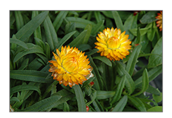
Basket Bon Bon Strawflower flowers

Vibrant and bold golden yellow blooms with coppery overtones are nestled on top of dark green foliage, creating a beautiful pop of color to landscapes, patio containers or hanging baskets; low maintenance-deadhead spent blooms