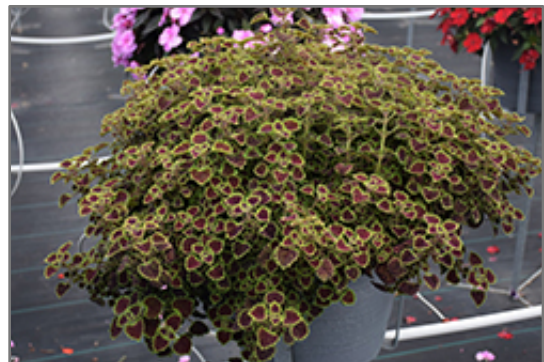
Burgundy Wedding Train Coleus