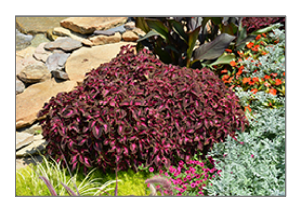
ColorBlaze Kingswood Torch Coleus

ColorBlaze Kingswood Torch Coleus is recommended for the following landscape applications;