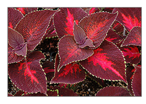
ColorBlaze Kingswood Torch Coleus foliage

This is a relatively low maintenance plant. The flowers of this plant may actually detract from its ornamental features, so they can be removed as they appear. Deer don't particularly care for this plant and will usually leave it alone in favor of tastier treats. It has no significant negative characteristics.